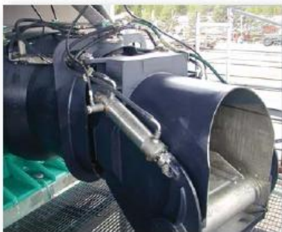
Water jet nozzle equipped with water lubricated Thordon GM2401 line bearings

GM2401 on the other side. Compared with Thordon's GM2401 bearing, the newer, harder rubber bearing still wore out fast.